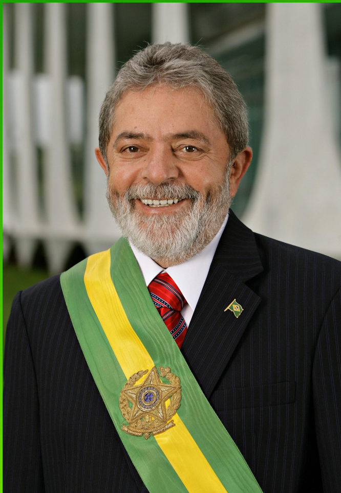
Luiz Inácio Lula da Silva